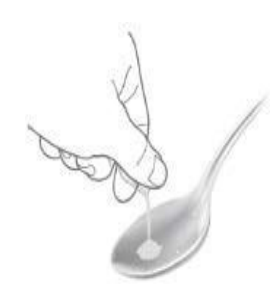
Pour all granules directly onto a spoon and place them in the child's mouth.