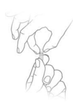
Step 5: Twist

Carefully twist off the top of the capsule.